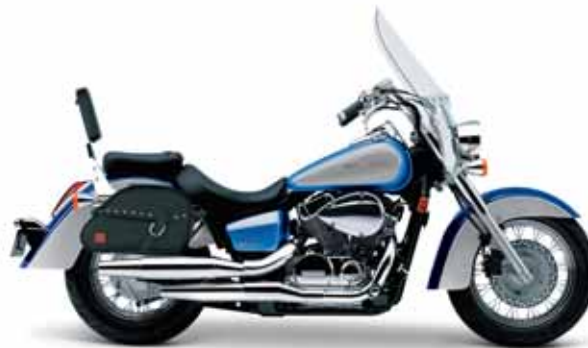
VT750T Shadow Tourer